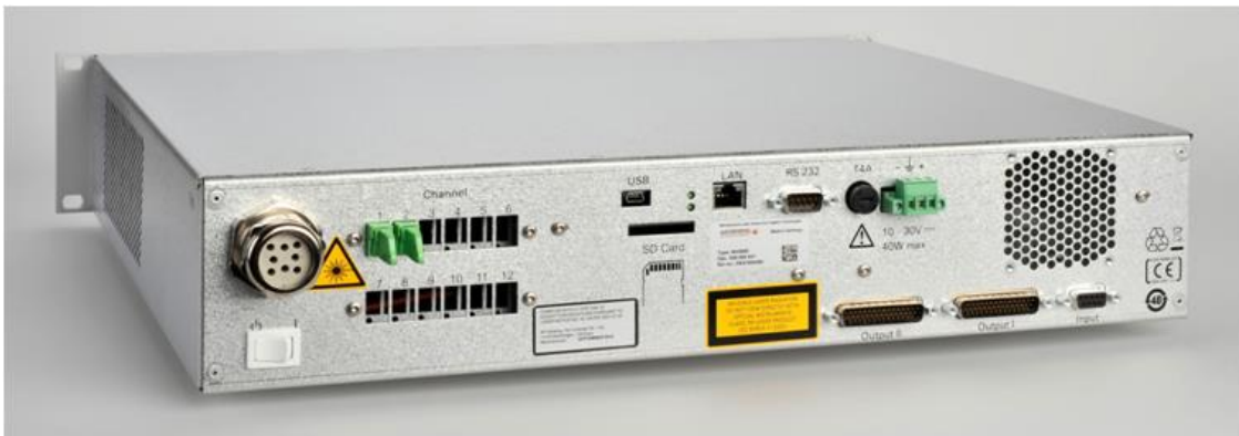
2-Channel Linear Power Series Instrument Integrated LAN & USB Interface, SD Card Reader and 20 Relays Output

In parallel, the AP Sensing Power Management Software Suite provides an easy to see “Graphical Thermal Profile” and logs all temperature traces into an SQL database for post processing and analysis.