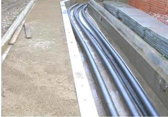
Cable Section in Trench