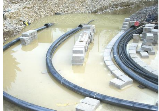
Road Crossing / Horizontal Drilling

In 2010 a new 380KV power circuit (north / south axis) was put into operation as part of a nationwide power grid improvement. Near Florence the high voltage circuit has buried sections in close proximity to a very populated valley and a historic church. The primary route was completed in trenches filled with thermal sand. The project also included challenging road crossings that used horizontal drilling to complete the construction.